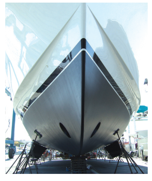
For further information, contact Interlux<sup>®</sup> today or visit the new website: www.yachtpaint.com

Instead, paint in the fall, once you've hauled the boat! Interlux<sup>®</sup> has antifoulings such as VC®17m Extra and Micron® Technology , that are products that you can paint early and launch in the Spring. So, when getting ready to winterize your boat, think about a high pressure water wash and as long as the surface is clean and dry, and the temperature doesn't drop below 41°F you're good to paint!